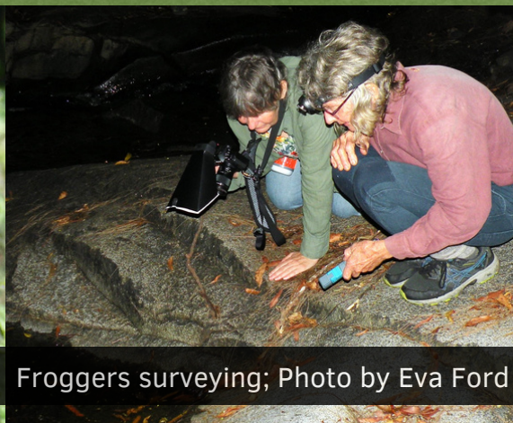
Mixophyes iteratus